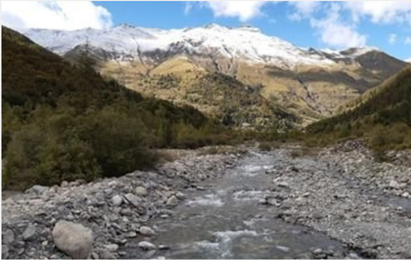
le torrent de Réallon