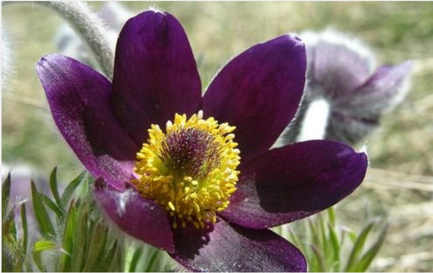
Pulsatille de montagne