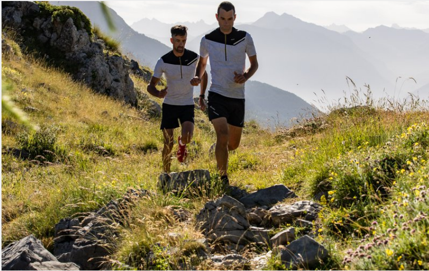
Trail Réallon