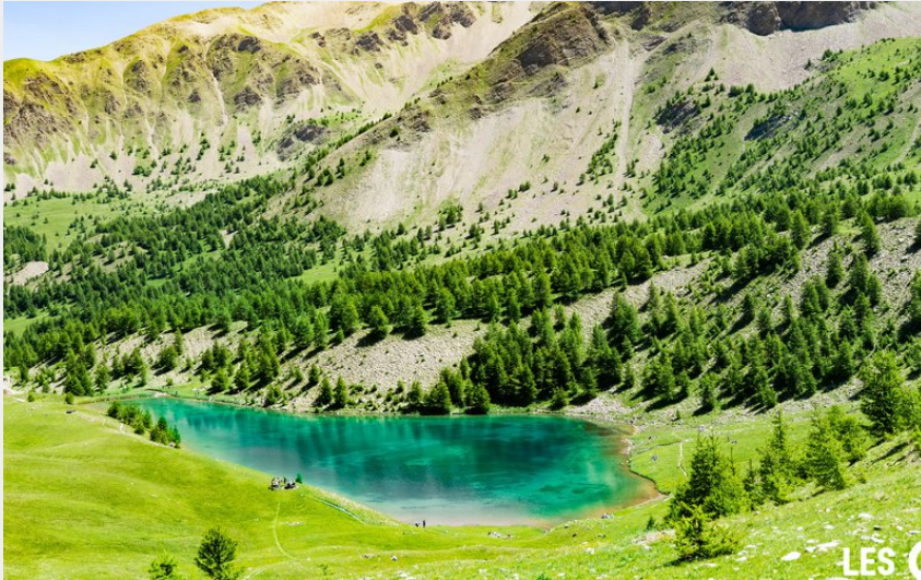
Lac Sainte Marguerite (Willy Camus)