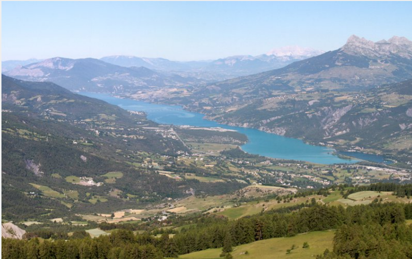
Vue sur le lac de Serre-Ponçon