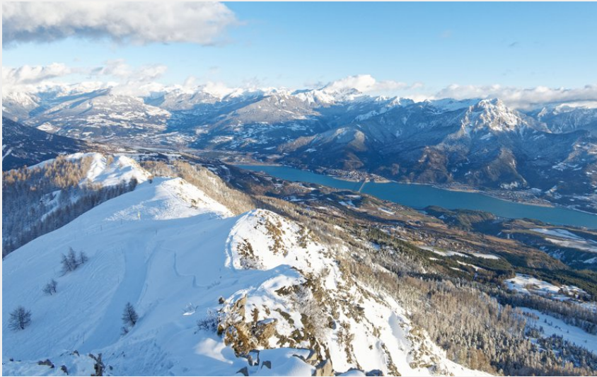
Lac de Serre-Ponçon