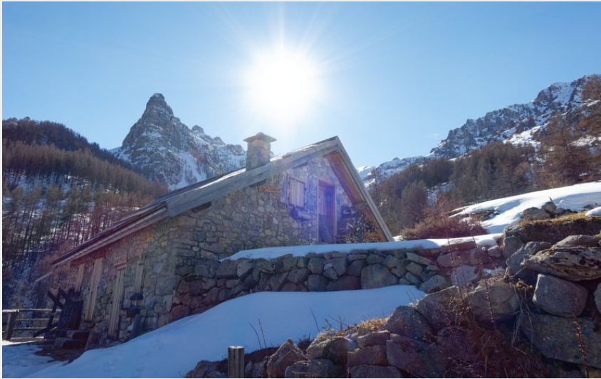
Chalet de Vaucluse (Lucien Mariotte)