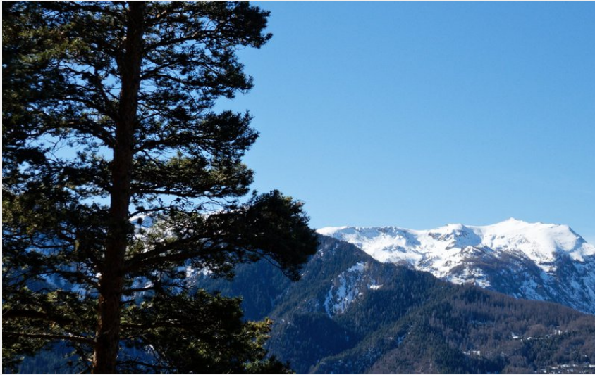
Sommet du Morgon