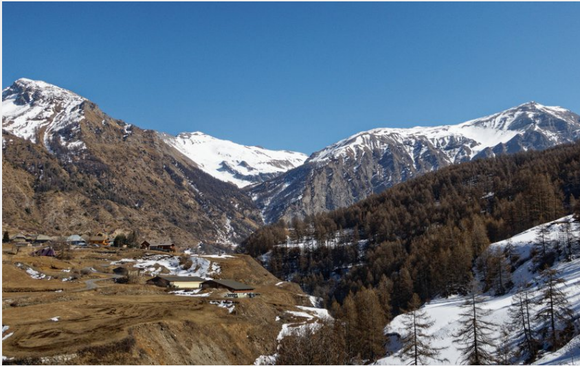
Hameau de la Chalp