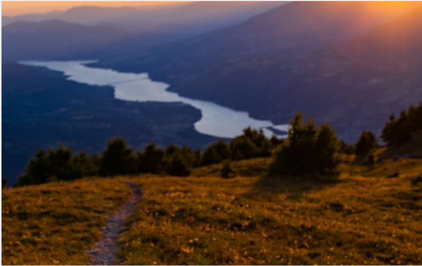
Coucher de soleil sur le lac (Willy Camus)