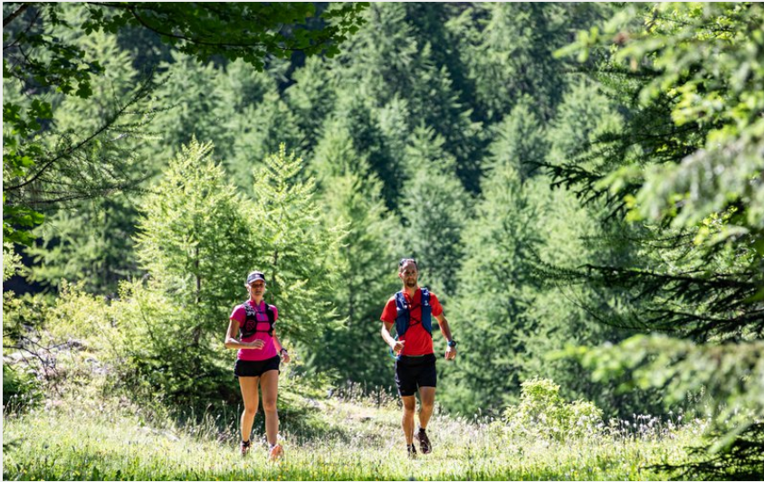
Forêt de Boscodon