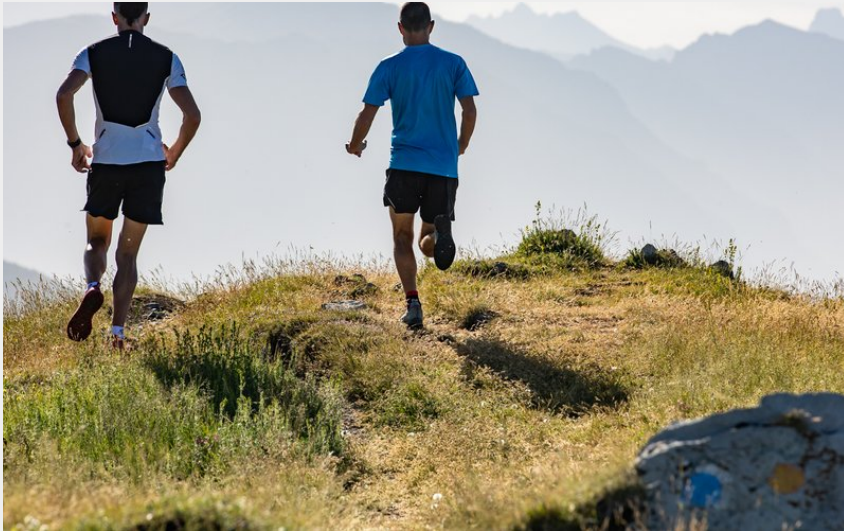
Trail Chorges