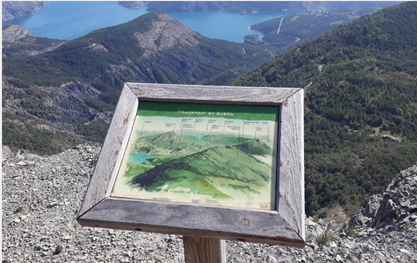
Vue sur le lac de Serre-Ponçon