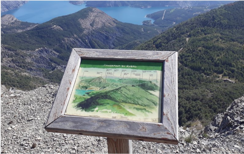
Vue sur le lac de Serre-Ponçon