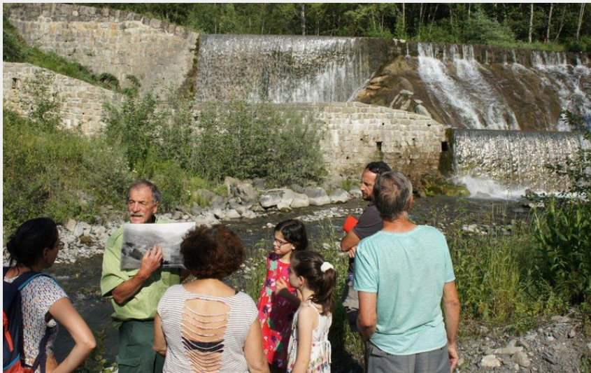
Parcours sens'action Les milles cascades (Pays d'Art et d'Histoire)