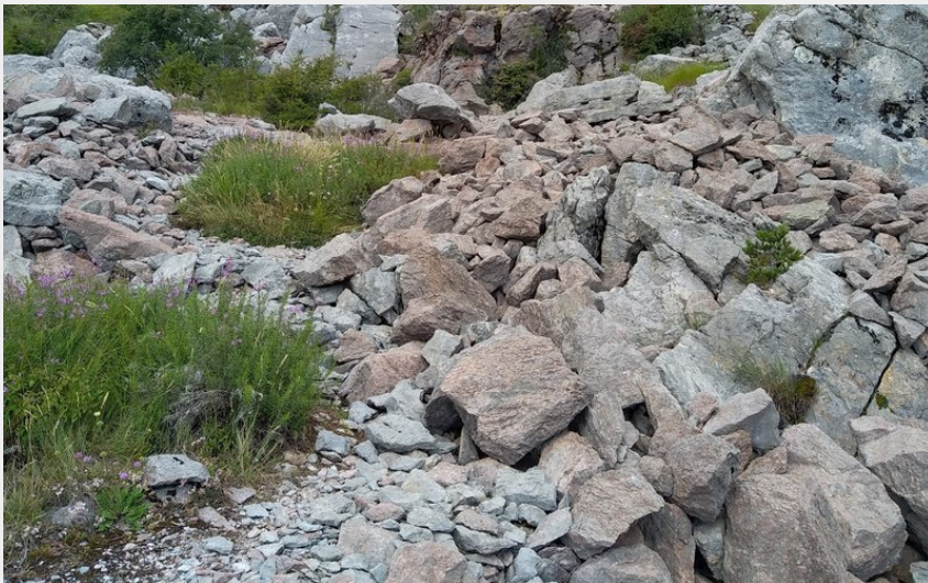
Carrière de Salados (Etienne Charles)