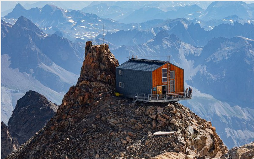
Refuge de l'Aigle