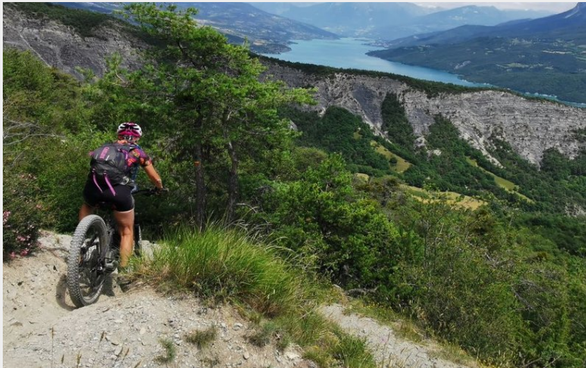
Descente sur le lac - sentier monotrace (Parc national Ecrins - E-Pedal)