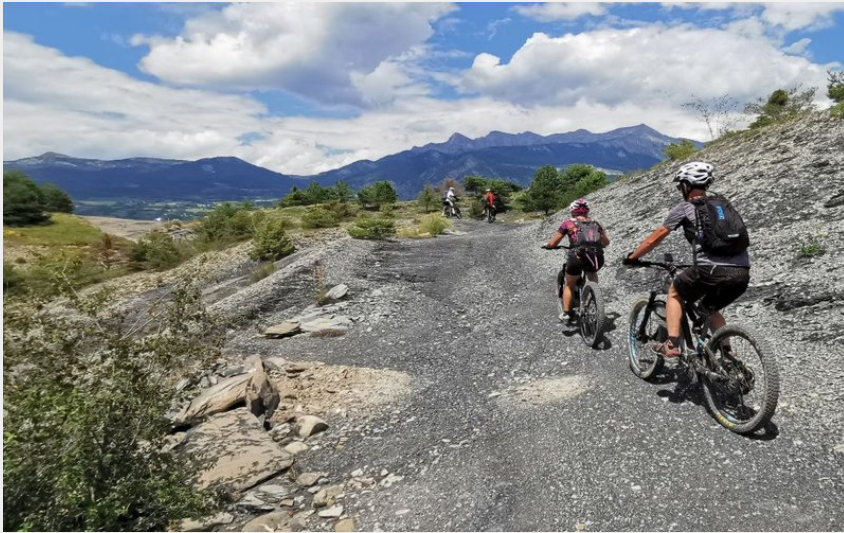
Dans les marnes (Parc national Ecrins - E-Pedal)