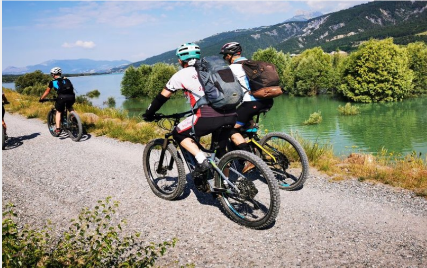
Bord du Lac à Embrun (Parc national Ecrins - E-Pedal)