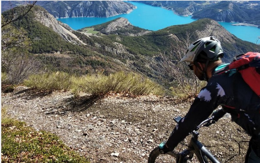
Vue sur le Saouze-du-Lac depuis les hauteurs de Rousset (Parc national des Ecrins - Emmanuel Danjou)