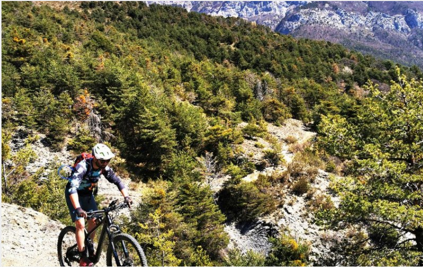
Vue atypique sous le Morgon (Parc national des Ecrins - Emmanuel Danjou)