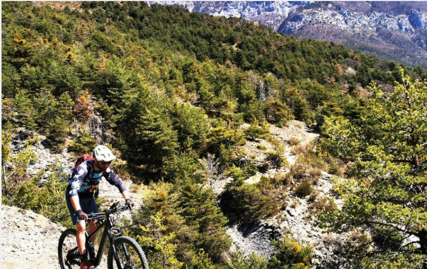
Vue atypique sous le Morgon (Parc national des Ecrins - Emmanuel Danjou)