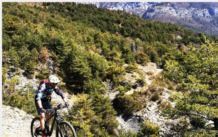
Vue atypique sous le Morgon (Parc national des Ecrins - Emmanuel Danjou)