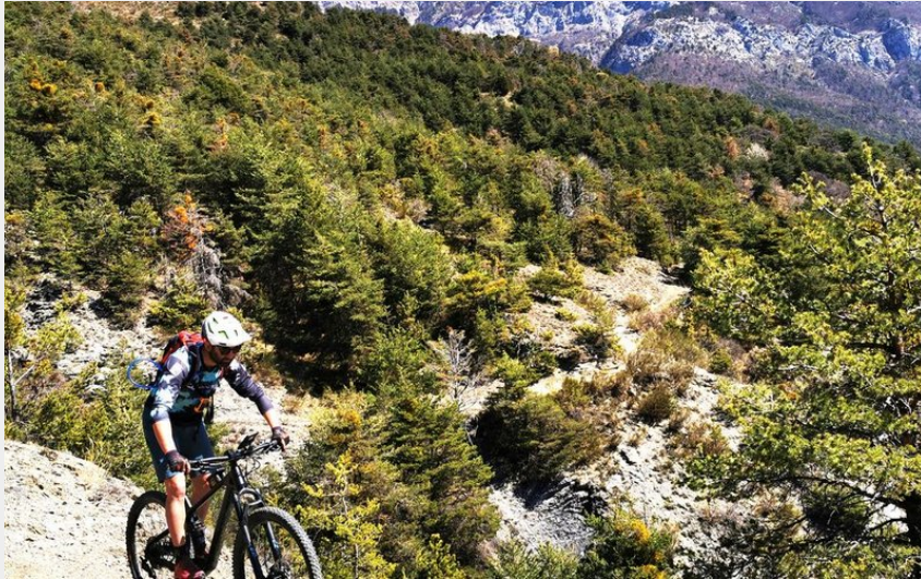
Vue atypique sous le Morgon (Parc national des Ecrins - Emmanuel Danjou)