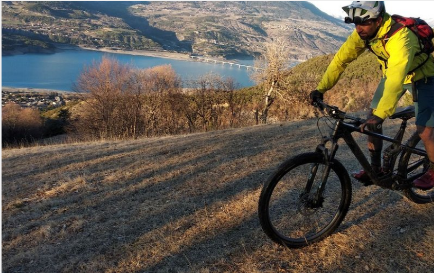
En surplomb du lac en automne (Parc national des Ecrins - Emmanuel Danjou)