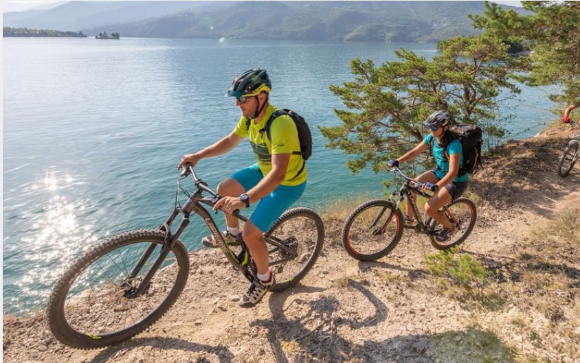
VTT Baie St-Michel