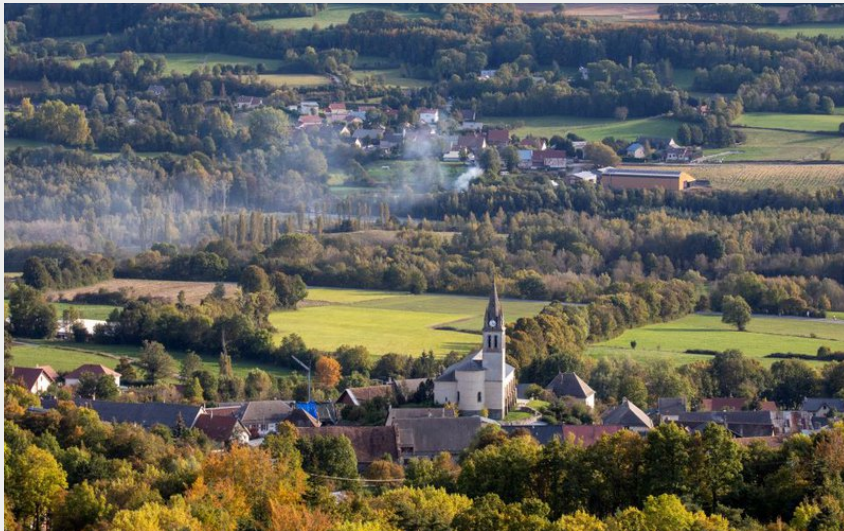
Village de Saint-Julien-en-Champsaur