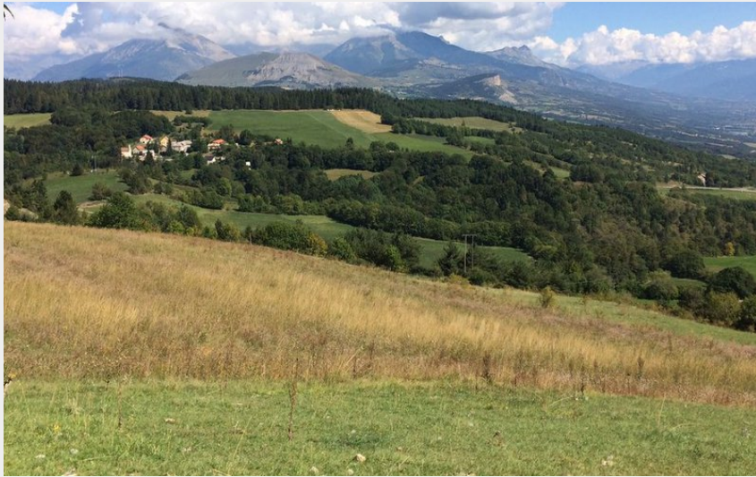
Vue sur le Chapeau de Napoléon