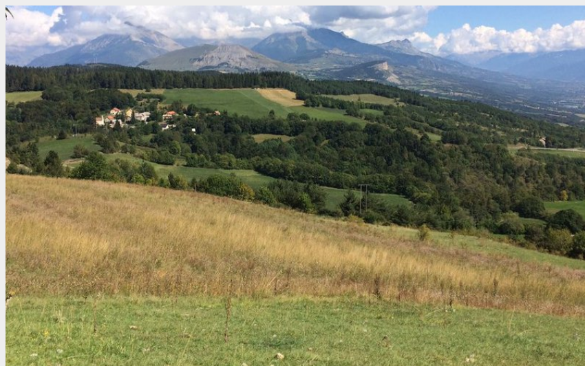
Vue sur le Chapeau de Napoléon