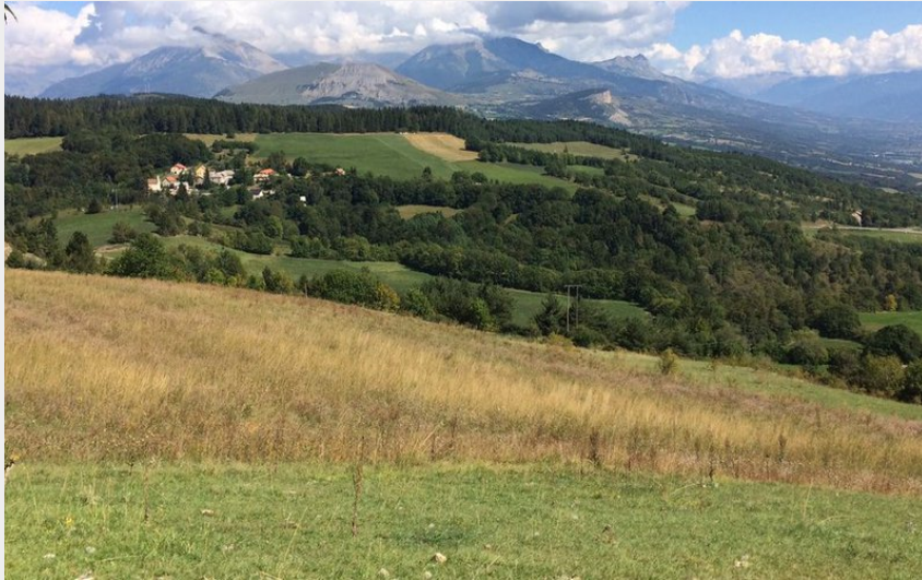
Vue sur le Chapeau de Napoléon