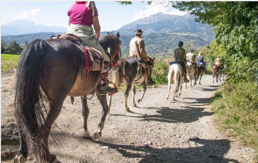
A St Léger Les Mélèzes