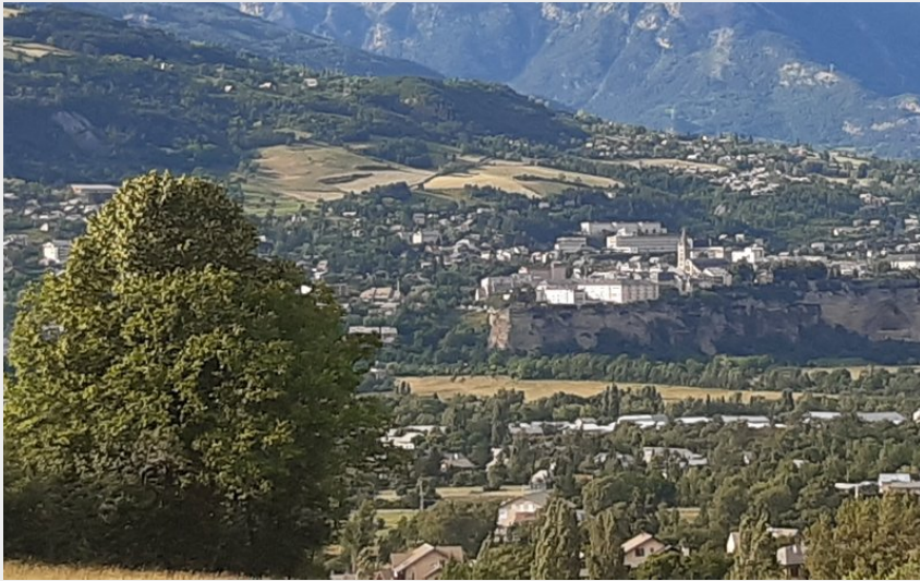
La ville haute d'Embrun (florimont.tilliere)