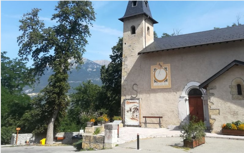
Eglise St Chaffrey