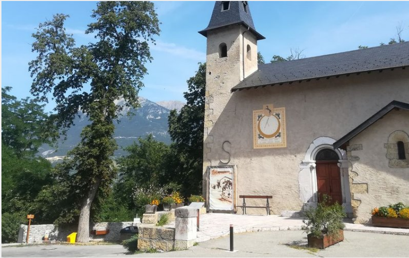
Eglise St Chaffrey