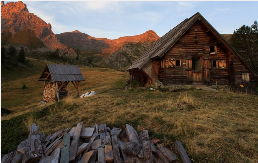
Refuge du Chardonnet