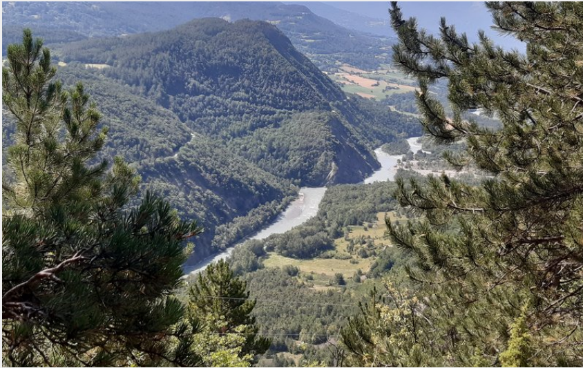
La vallée de la Durance (florimont.tilliere)