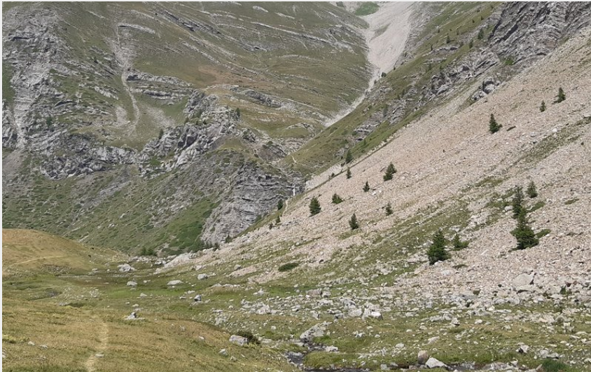
Le col de Reyssas (florimont.tilliere)