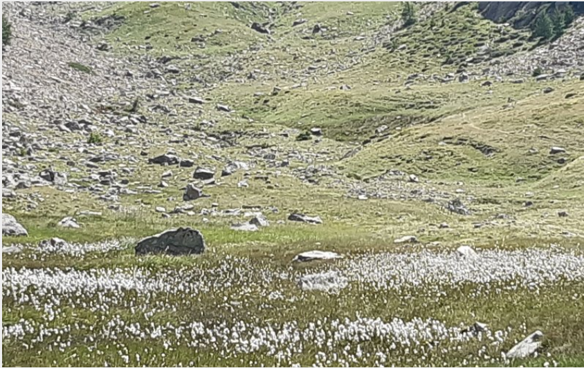
champ de linaigrettes (florimont.tilliere)