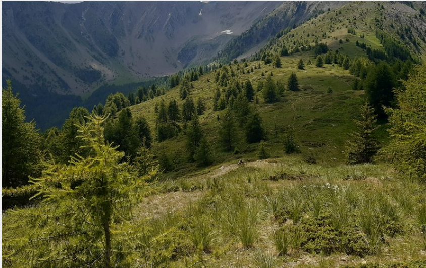
Sur la crête du Lauzet