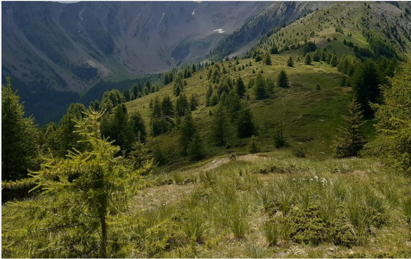
Sur la crête du Lauzet