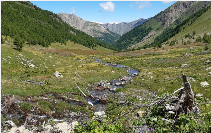
Les alpages sous le col (florimont.tilliere)