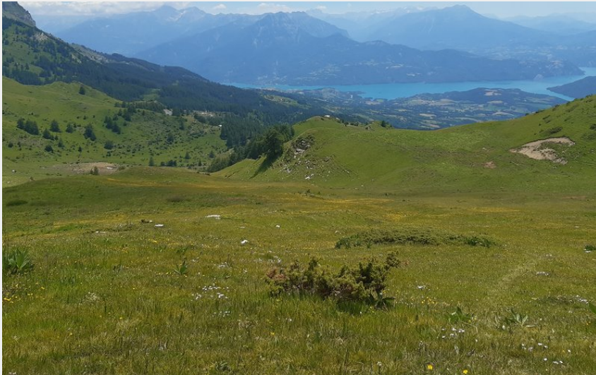
Alpages sous le col (florimont.tilliere)