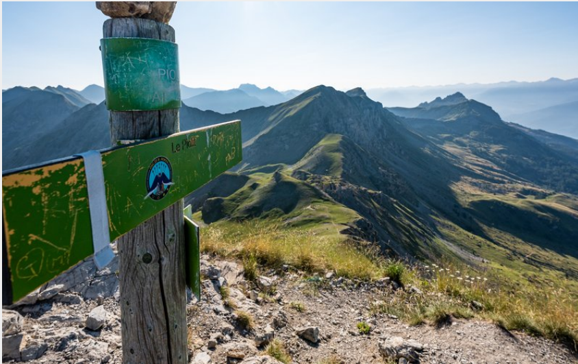
Sommet du Piolit (Rémi Morel)