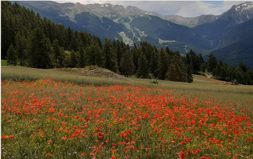
Champ de coquelicots (florimont.tilliere)