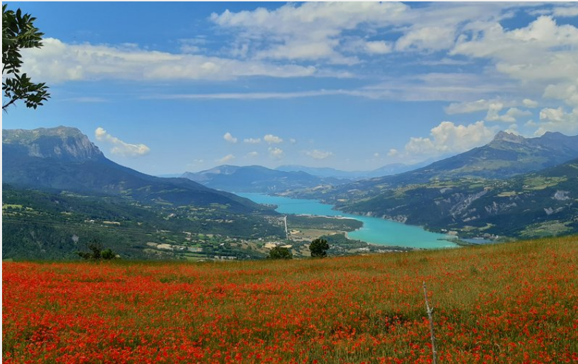
Champ de coquelicots surplombant le lac (florimont.tilliere)