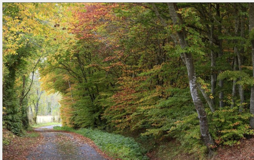
Bois de Saint-Laurent