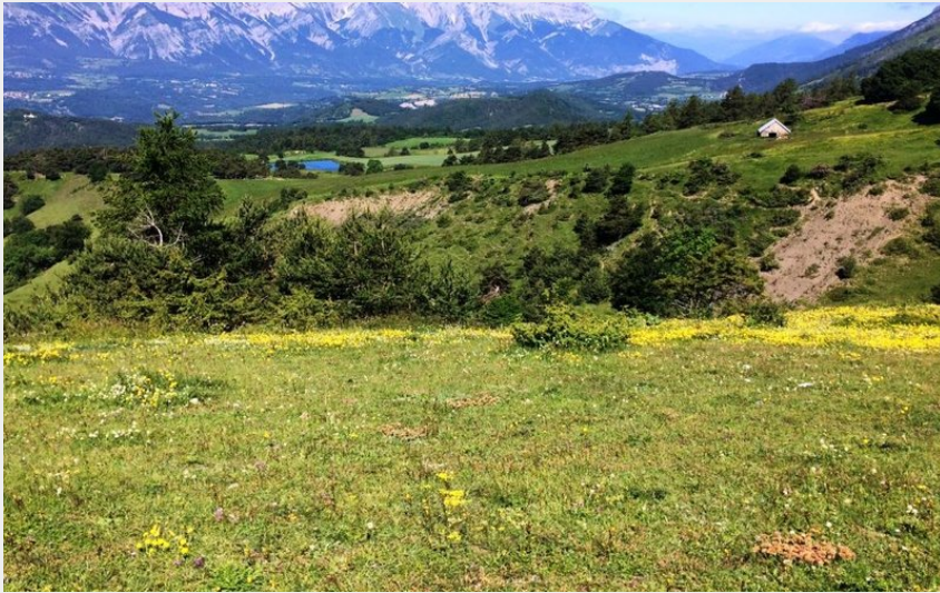
Lac de Barbeyroux en contrebas