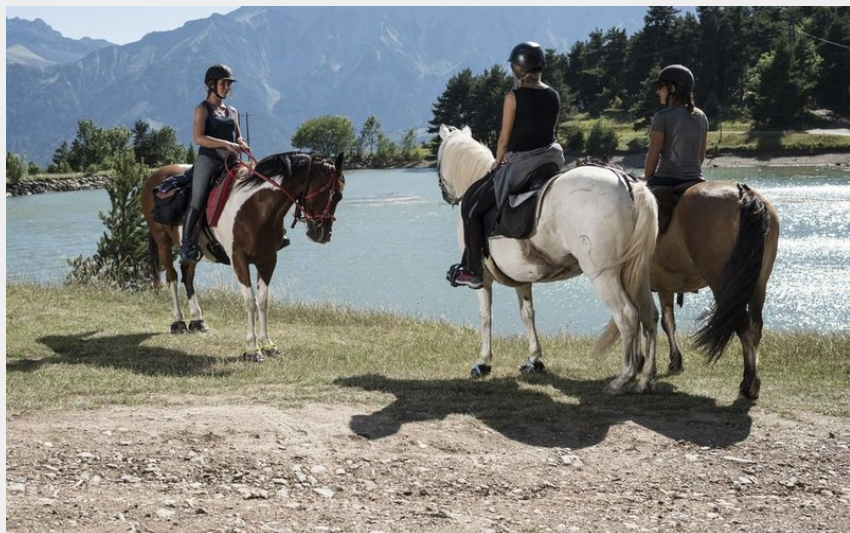
Cavaliers au bord du lac de Roaffan