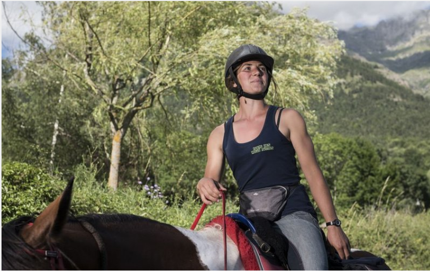
Randonneuse sur son cheval