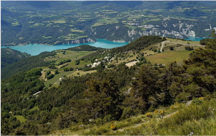
Vue sur la vallée de l'Ubaye (florimont.tilliere)